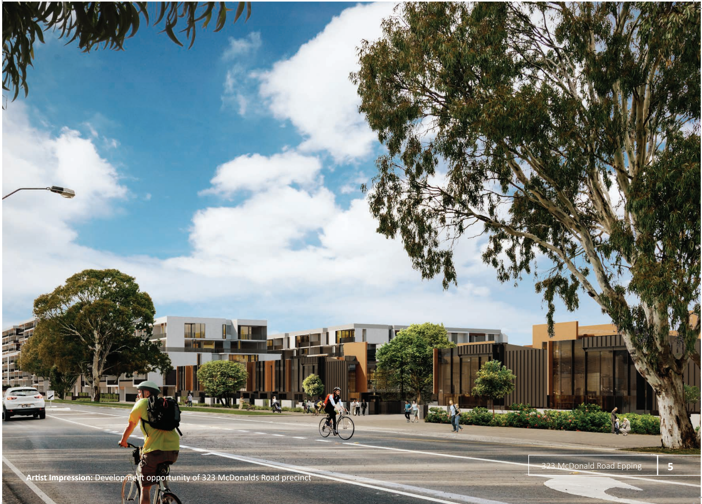
Artist Impression: Development opportunity of 323 McDonalds Road precinct